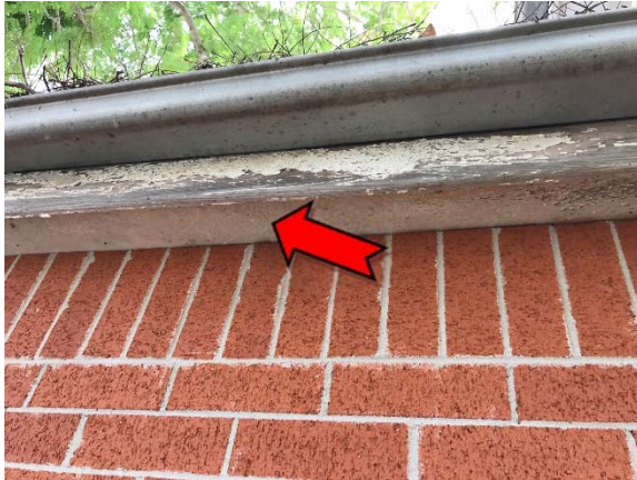
Photo 1. Exterior, south elevation, eaves – asbestos-containing fibre cement sheeting.