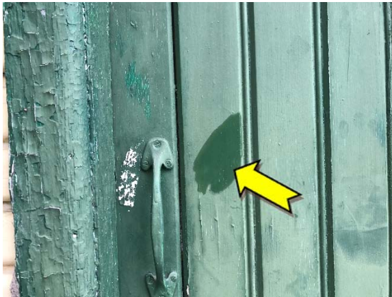
Photo 3. Exterior, office, door - suspected lead-containing green upper paint system.