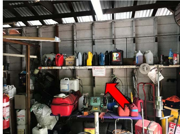
Photo 2. Interior, garage, walls – non asbestos-containing fibre cement sheeting.