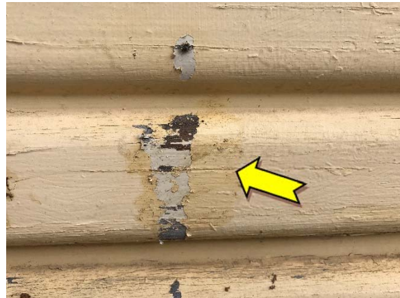
Photo 4. Exterior, office, walls - suspected lead-containing yellow upper paint system.